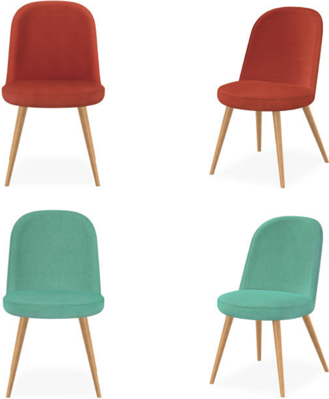
Astrid Café Chair 咖啡椅