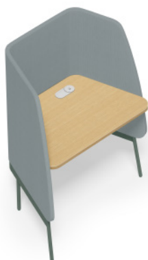
Single Workpod 单人工作站