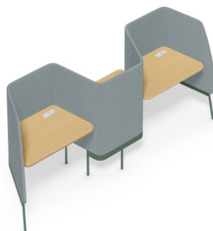
Triple Workpod 三人工作站