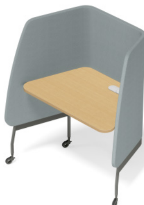
Single Workpod with Castor 单人工作站带脚轮