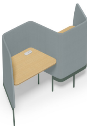
Double Workpod 双人工作站